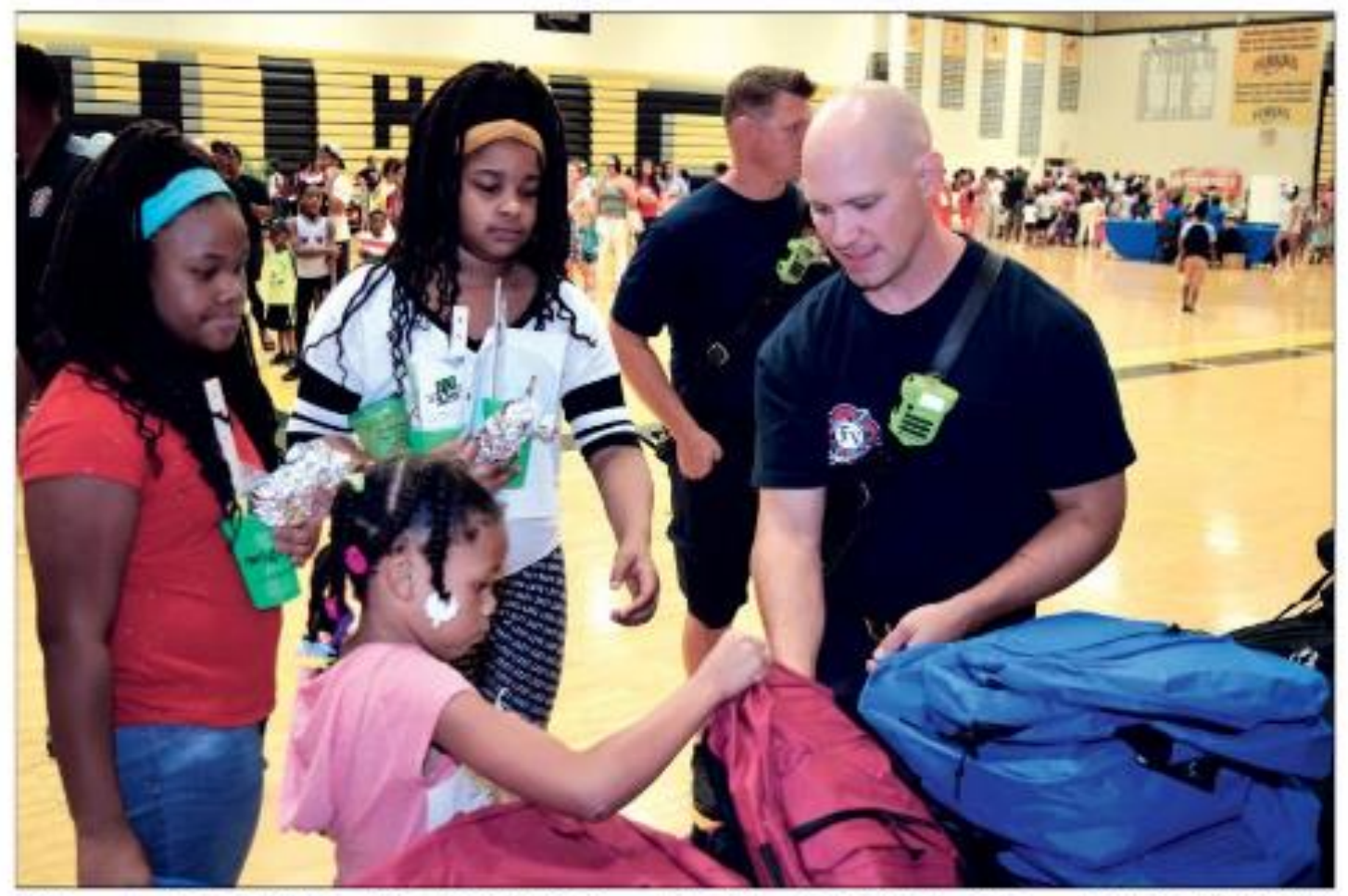
Students, parents and faculty attend the Harelwood School District Back to School Community Fair at Hazelwood Central High School on July 27.